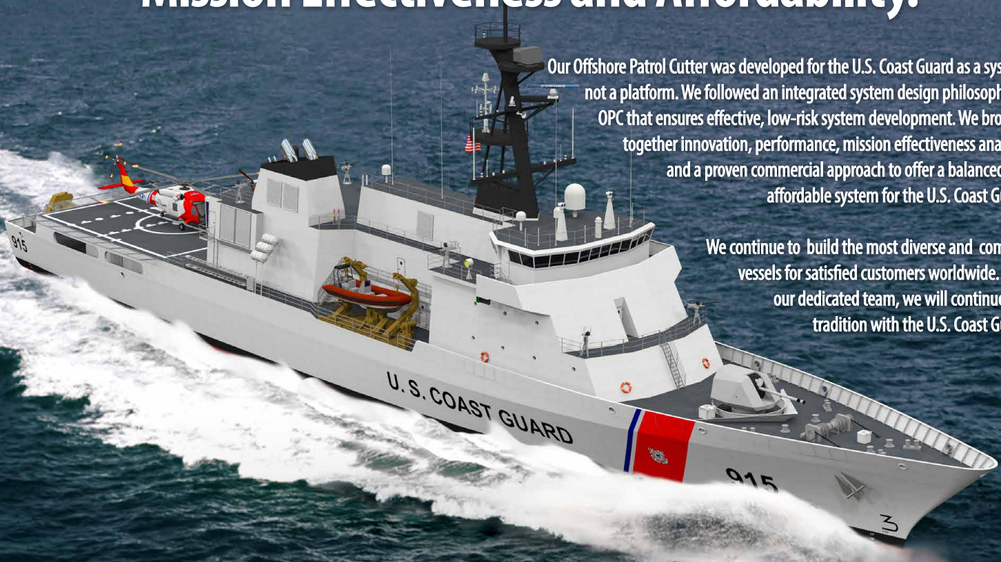
Offshore Patrol Cutter for the United States Coast Guard

We continue to build the most diverse and complex vessels for satisfied customers worldwide. With our dedicated team, we will continue this tradition with the U.S. Coast Guard.